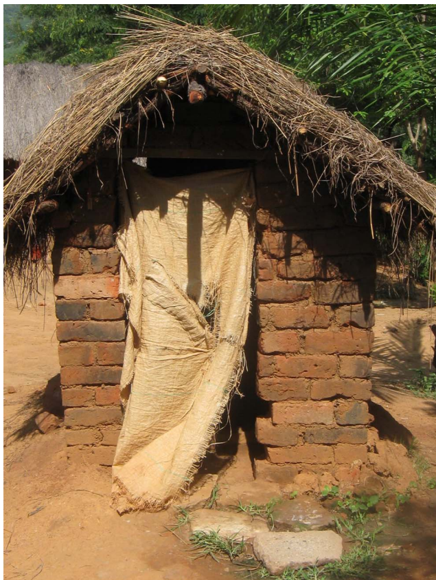
Figure 3 An improved form of sanitation: a household pit latrine in Tanzania.